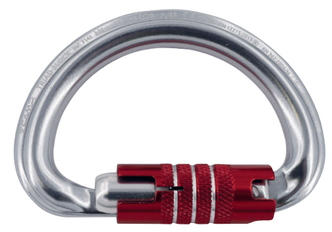
Automatic lock requires three actions to open: slide, twist and pull.